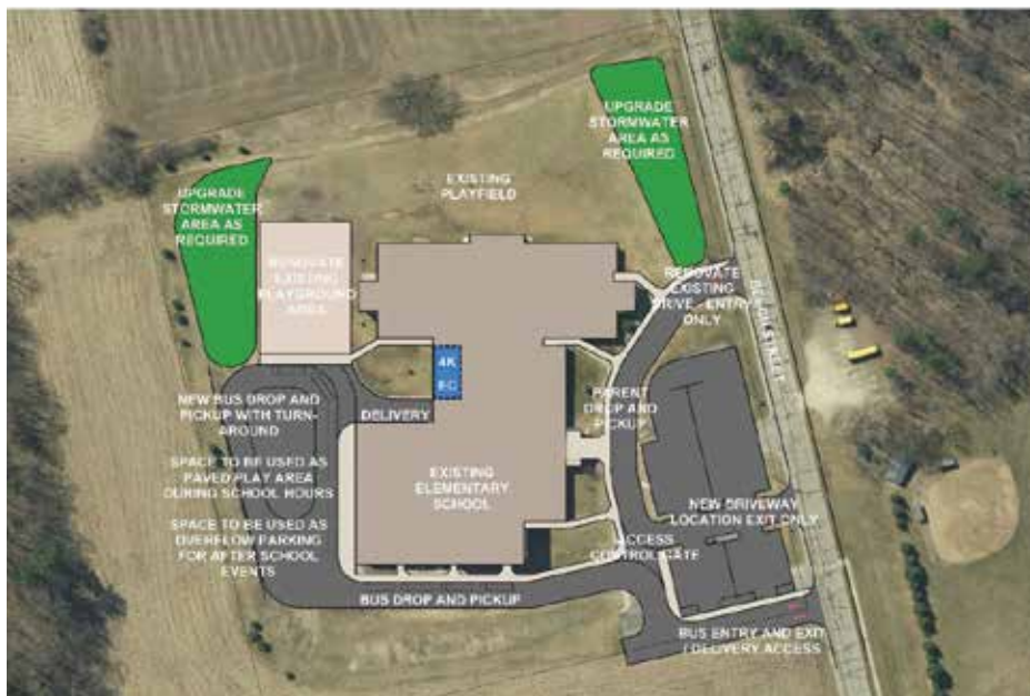
Manawa Elementary School site