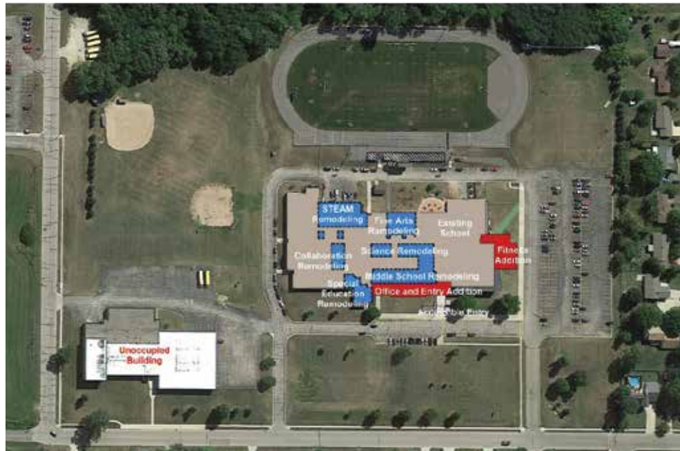
Little Wolf Jr./Sr. High School site

Shall the School District of Manawa, Waupaca County, Wisconsin be authorized to exceed the revenue limit specified in Section 121.91, Wisconsin Statutes, by $365,000 for the [2019-2020] school year, for non-recurring purposes consisting of demolishing the vacant former elementary school building and returning the site to green space?