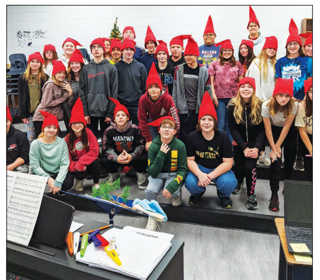
Middle School choir students enjoying winter events