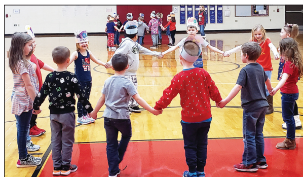
Kindergartners dance a Native American Friendship Dance during the Manawa Elementary School Olympics.

The Kindergartners represented the United States with a Native American Friendship Dance. The 1st grade performed the Troika from the Russian Federation. 2nd grader learned an Inuit Drum Dance from Canada. Germany was represented by our 3rd graders with a blacksmith's apprentice dance. The 4th graders learned the Schuhplattler, which is from Austria. 5th graders finished the program with a Schottische from Norway.