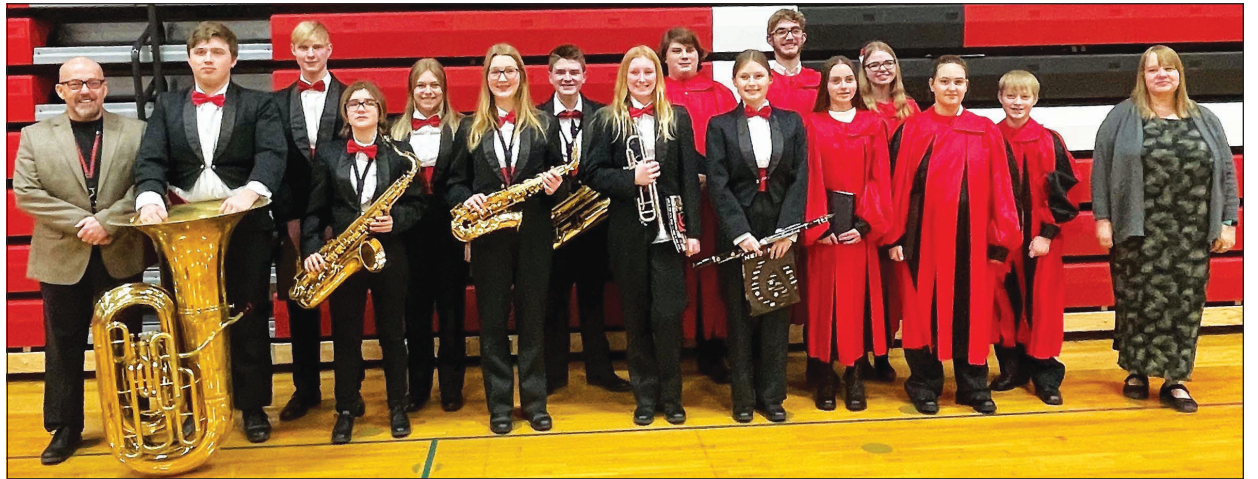
LWHS Music All Stars

The choir is enjoying the support of the school, administration, and community as they continue to grow and thrive with ever increasing opportunities for the students in the world of choral music.