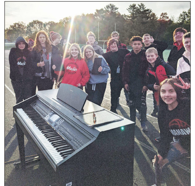
High School Choir, National Anthem