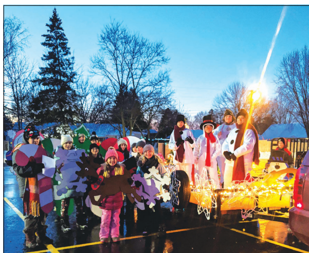
Choir Float, Miracle on Bridge Street