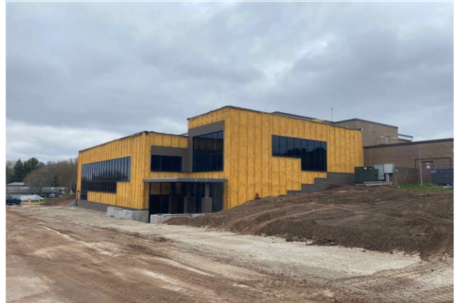
Fitness Center ready for metal wall panels