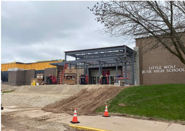
Main Entrance steel erected