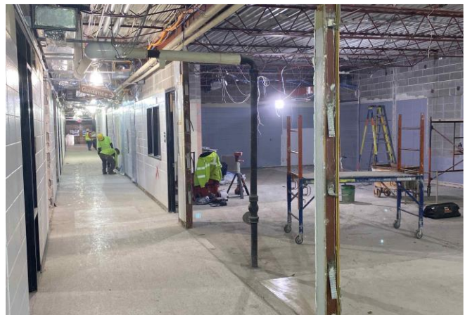
Demolition occurring new Middle School Suite