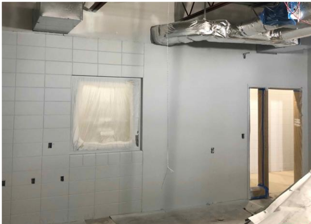
Painting at Special Ed suite