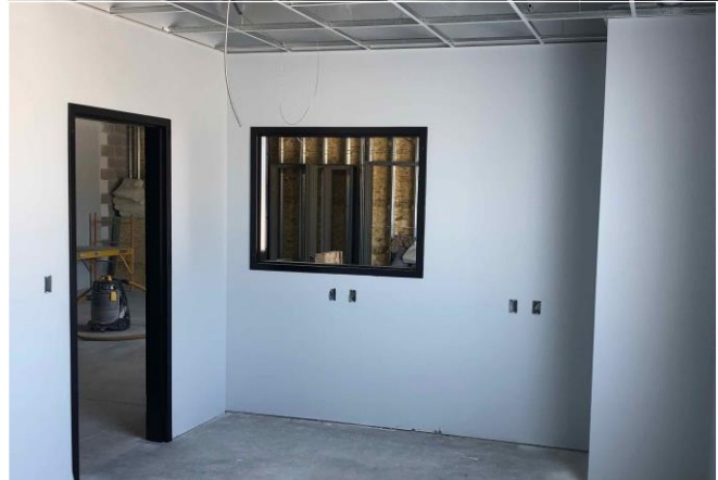
Painting at Administration Addition