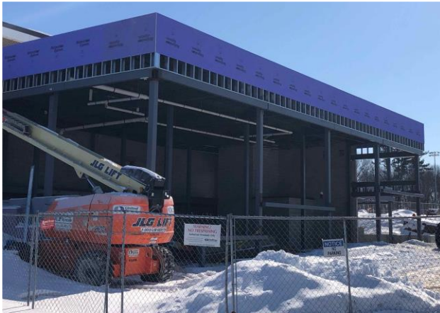
Exterior walls & sheathing at Fitness Addition