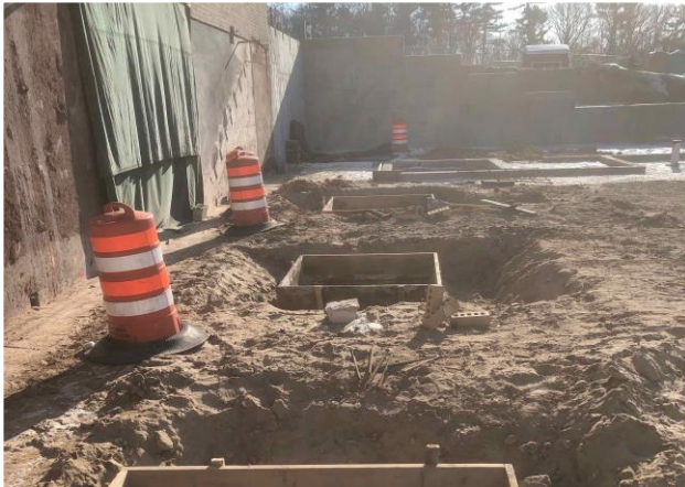
Interior footings formed at Fitness Addition