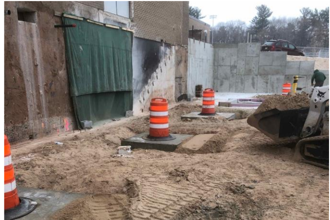
Interior footings poured at Fitness Addition