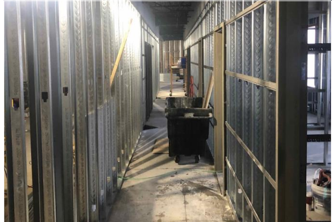
Interior framing continues at Admin Addition