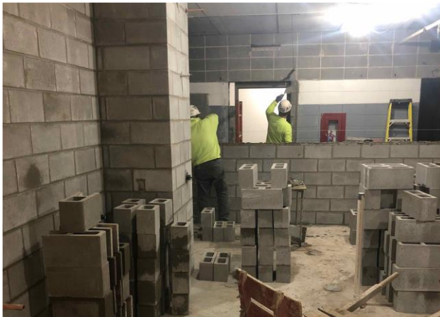
Masonry work at lower level