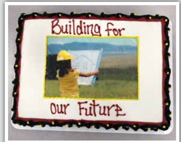
MANAWA RESIDENTS CELEBRATED the successful passage of two referenda with some snacks and fellowship during the Feb. 6 Gallery Walk at the Jr/ Sr. High School. Guests enjoyed visiting, getting an overview of School Perceptions Survey 2 & Gym Referendum, viewing plans of the districts expansion and having a question and answer time.