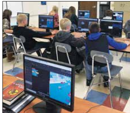
7th grade students during qualifying round CRCC competition.