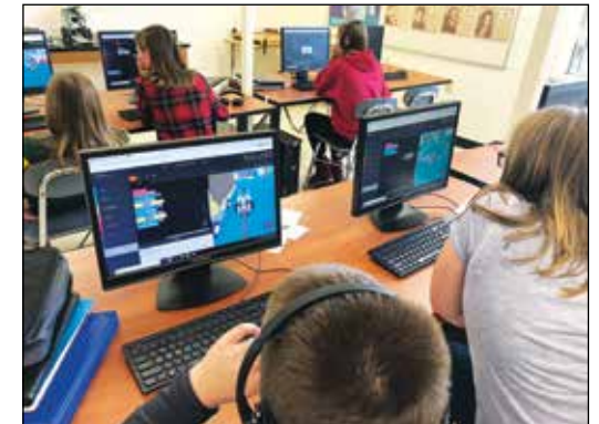
7th grade students during qualifying round CRCC competition.