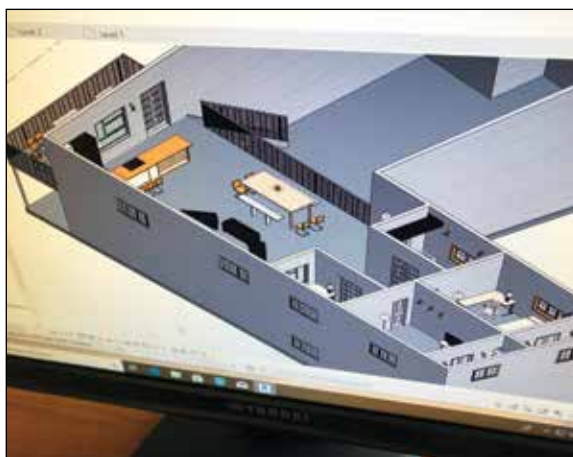
Ethan's model in Autodesk Revit.