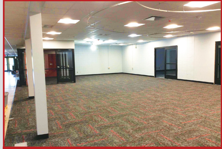
NEW HIGH SCHOOL COLLABORATION AREA