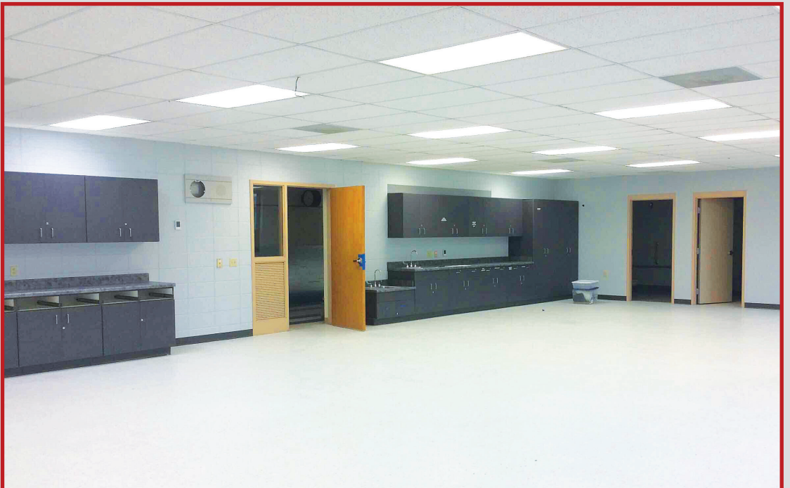
AFTER - NEW 4K CLASSROOM

GO WOLVES! GO WOLVES! GO WOLVES! GO WOLVES! GO WOLVES! GO WOLVES! GO WOLVES! GO WOLVES!