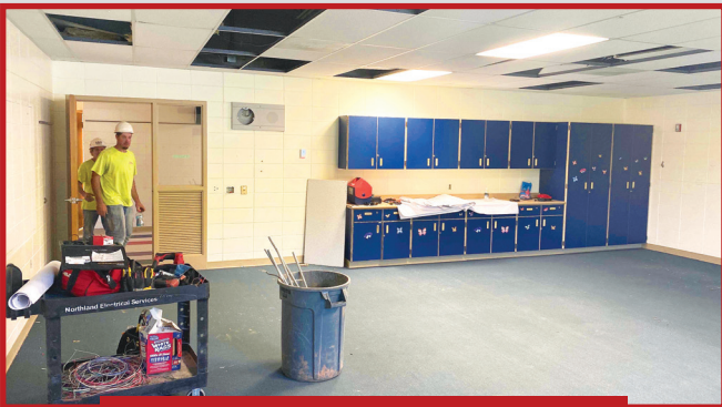
BEFORE - 5K CLASSROOMS