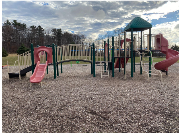
Ages 5-12 Equipment