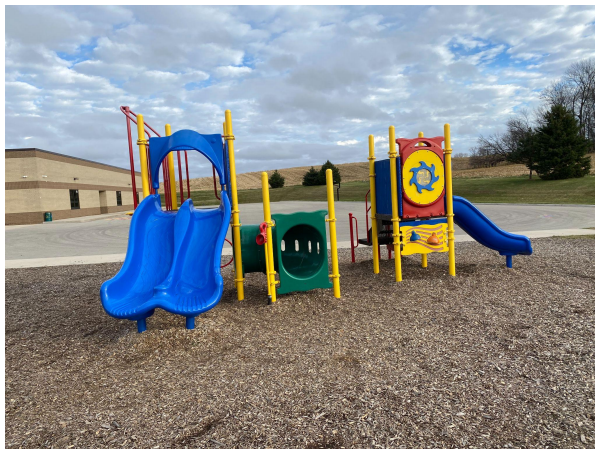
Ages 2-5 Equipment

I recommend that the SDM use $150,000 of the Fund Balance to purchase 2 pieces of playground equipment from Lee Recreation to replace the equipment that has safety concerns. The pieces of equipment to be removed and replaced are pictured below. Any cost over $150,000 would come from the MES building budget and MES PTO.